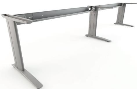
Linear bench system using Element Fixed Height End and Central legs with Telescopic beams