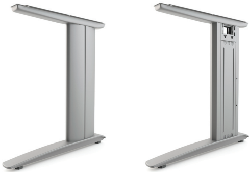
Element Fixed height end and central legs