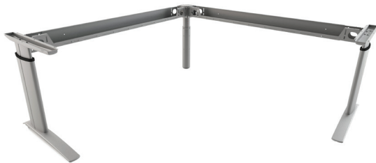
Element Tech Height Frame - Corner Workstation